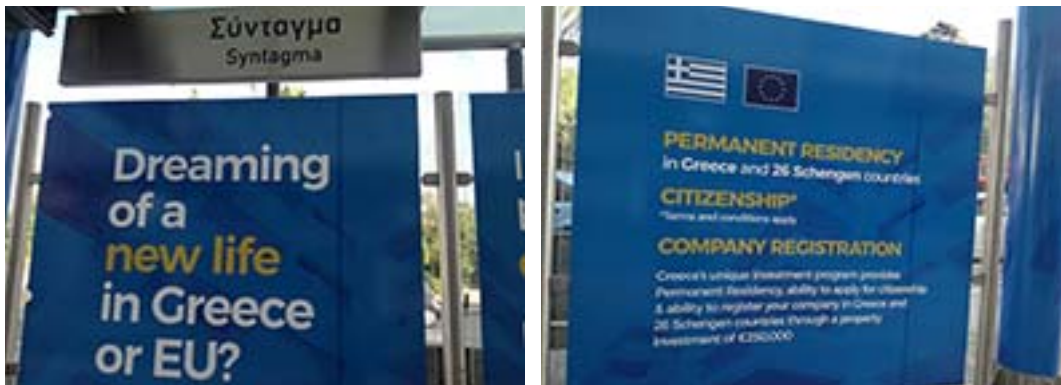
Figures 3 and 4. Citizenship for sale in Greece. Photos by the author, Athens, November 2018.

Acoustic strategies today fit into a larger picture of solidaritarian and migrant activism, with people demanding the rights of citizenship while simultaneously drawing attention to how precarious it is (Tyler and Marciniak 2013). Citizenship, from this perspective, becomes something turbulent: subject to violence and rupture when its contingencies are exposed. Citizenship is not only something conferred or denied by the nation-state. Citizenship is something bought and sold (Figures 2 and 3). Citizenship is a border, filtering; perhaps the most brutally patrolled