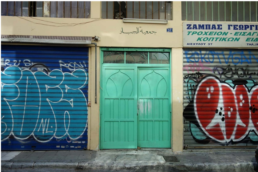
Figure 1. An unofficial mosque on Eschilou Street. Photograph by the author, August 2017.

The result is probably a bit opaque. But then, people, particularly those seeking refuge, have the right to opacity (Khosravi 2016). These are not refugee stories. Voices come and go, shout and scatter; narratives flicker and flee; at no point is it clear which sounds are “Greek” and which are “refugee.” Instead, everything migrates. Part I begins at the Victoria metro station beneath the square of the same name—a key site for multiple refugee communities living in the city. It then jumps to a bazaar held every Sunday across town at Botanikos. The bazaar is located just down the road from the Eleonas refugee camp, so while it is mostly associated with the Roma community of the city, it is now also part of a network of trade for newer refugee communities. The sound of buzzing insects—which blanket the Athens soundscape through the summer months—then comes into the foreground, before this part closes with the almost-silence of the street outside an unofficial mosque, a sound marked by its absence, in the recently gentrified Psiri area of the city (Figure 1).