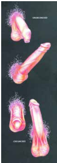
Figure 1: Puberty Boy .