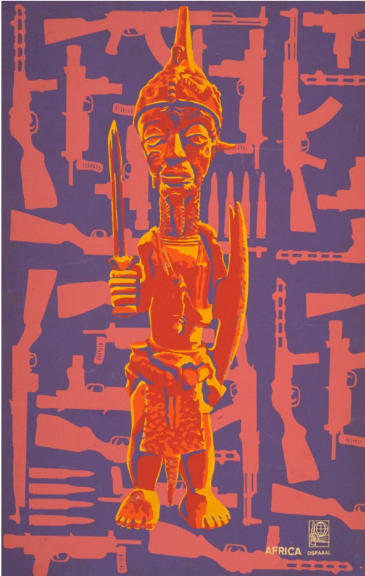
Figure 3 “Africa,” 1969, by Jesús Forjans Boade.